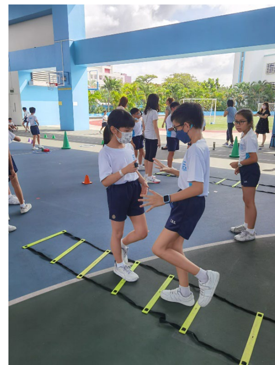
Holistic Health Festival